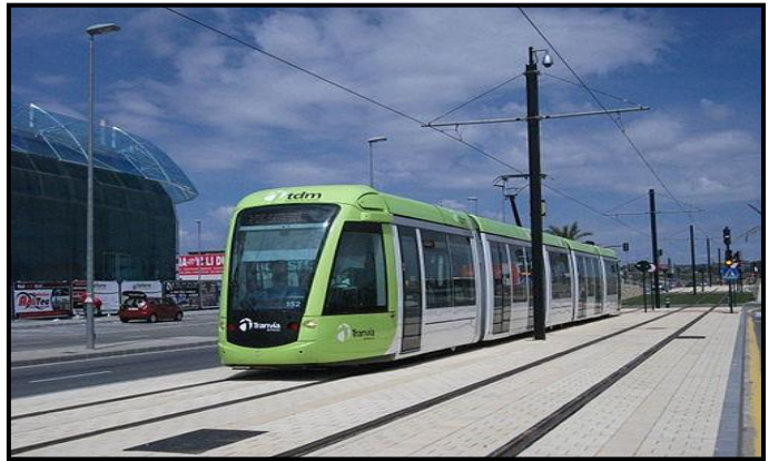
Light rail in the Spanish city of Murcia (Pop: 430,000)

It is also critical that this public transport network links into a quality active transport network – for use by pedestrians and cyclists. Footpaths, cycleways, and infrastructure at transit stops and interchanges are all needed to support the crucial linking of active travel and public transport travel. The ACT Greens outlined a comprehensive approach to this in the ACT Greens' 2010 Active Transport Plan. vi